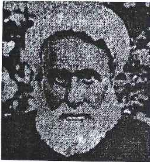
Shaikh Abbas bin Mohammad Reza al Qummi (r.a)

The Trustworthy among Traditionists, Shaikh Abbas bin Mohammad Reza al Qummi (May Allah sanctify his grave), was born in Qum in the year 1296 A.H. Since early childhood he was inclined towards pursuing knowledge. He studied the preliminary course in his hometown under various Eminent Erudites of his time. His quest for knowledge could not be satiated and to further his education he migrated to Najaf when he was around 21 years of age. There he studied under the Celebrated Scholar and Master Traditionist Ayatullah Mirza Husain Noori Tabarsi and within a short period became one of his most endeared students. He gained authorities from his teacher in the fields of Rational and Traditional Sciences, Jurisprudence, Exegesis, Scholasticism, and other Sciences and excelled in them. After the death of his teacher, he migrated to his hometown Qum, then to Mashhad, and again to Qum at the instance of Ayatullah al Uzma Shaikh Abdul Karim Haeri Yazdi, who had revived the Theological Center there.